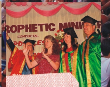
Glimpses School of the Holy Spirit Ladies Apostles and prophets School